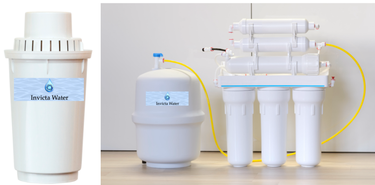
Invicta Water Consumer/Home Use Products

Invicta Water’s product development for home use water filters includes filters that can be used in a simple pitchers, under-sink, appliance, and countertop filtration systems.